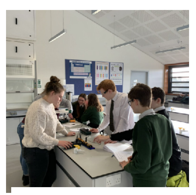
Sixth form mentors running a science support workshop for Year 10 students

"The Leadership Short Course is growing in popularity at Abingdon School. The ASDAN certificate given at the end of the course makes it really worthwhile to the pupils.